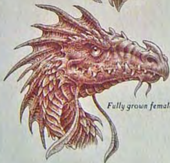
Fully grown female