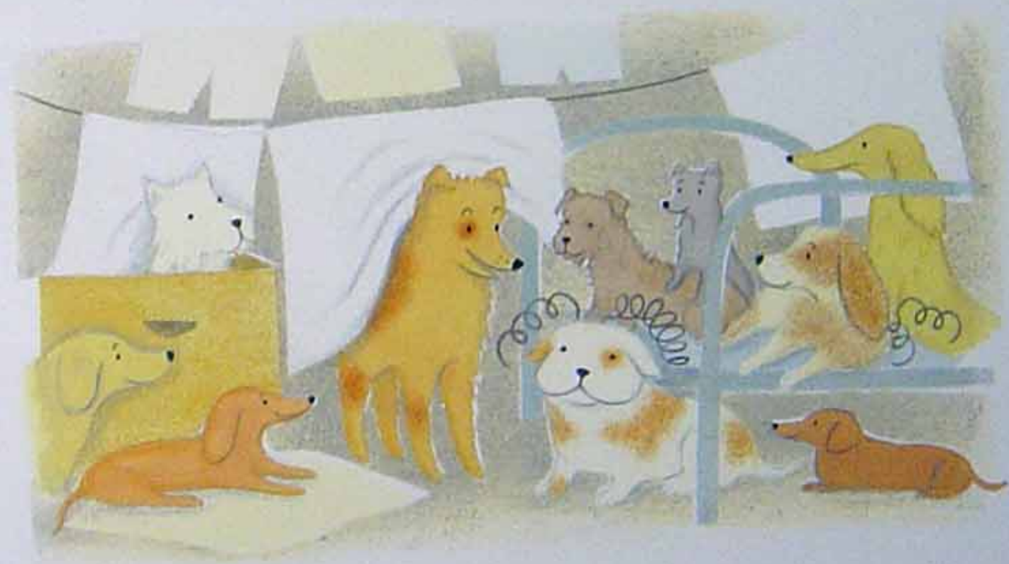
And here is the dog called Samuel Bloom, Who lives in a crowded tenement room.