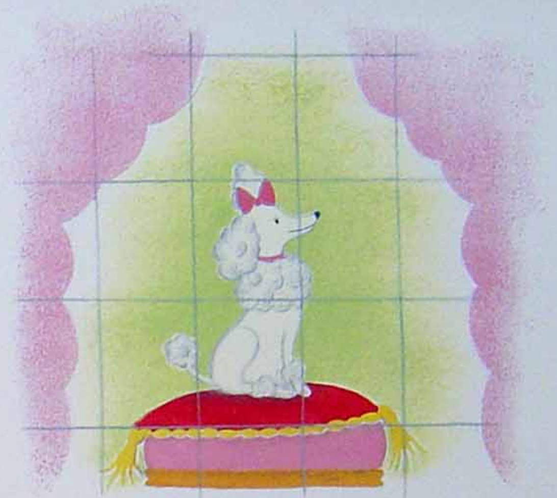
Here is the dog called Esme Lamour, Who lives in a penthouse right on the top floor.