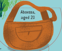
Aboessa, aged 20