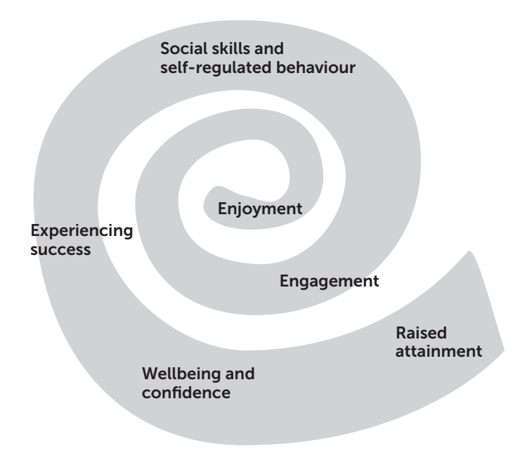
Figure 1: The pathway to raised attainment through outdoor learning (Waite et al., 2016, p. 10)

By enabling children to engage with different learning contexts and methods, teaching outdoors can bring improvement in attainment and other key desirable outcomes, broadly identified as falling into the following categories (Malone and Waite, 2016):