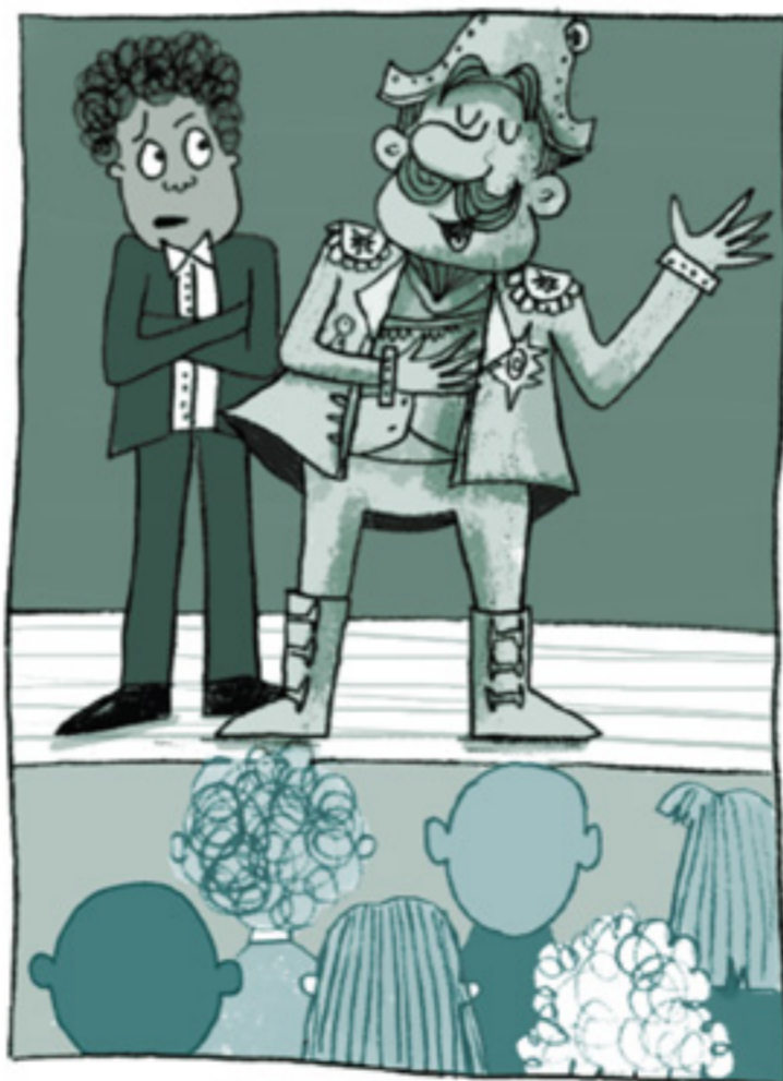
The best speech of the evening