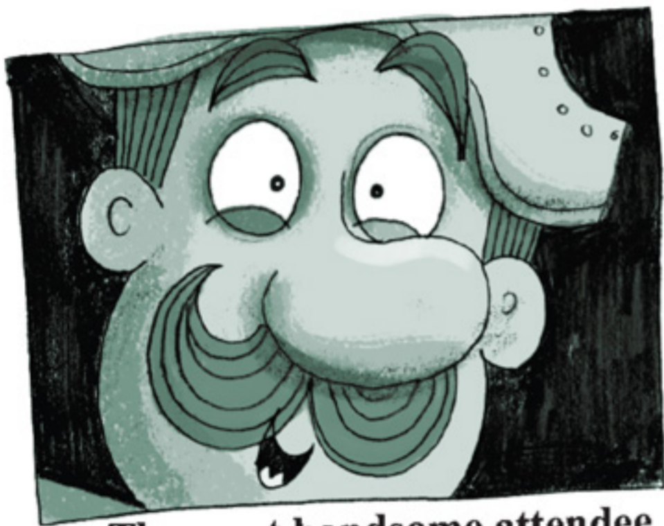
The most handsome attendee