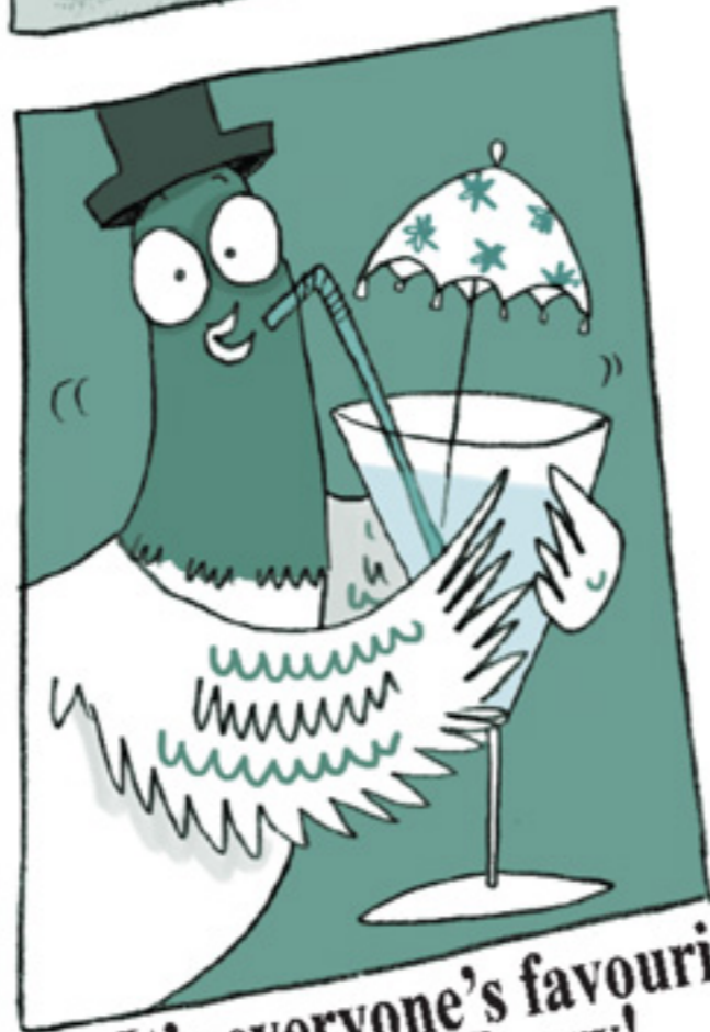
It's everyone's favourite pigeon, Barry!