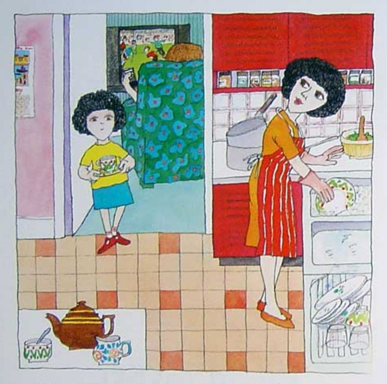
Isabel was a very good girl. She was helpful and she always did as she was told. But, Isabel had a noisy tummy.