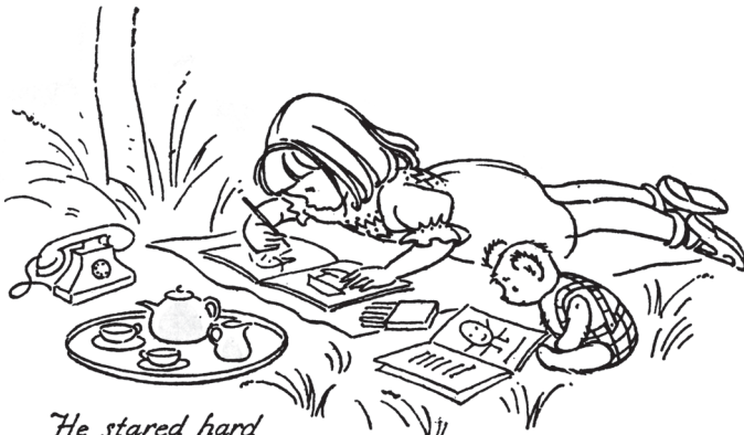
He stared hard at a picture of Humpty-Dumpty

Deborah lay on her tummy and coloured the whole of an elephant and half a Noah's ark, and Teddy Robinson stared hard at a picture of Humpty-Dumpty and tried to remember the words. He couldn't really read, but he loved pretending to.